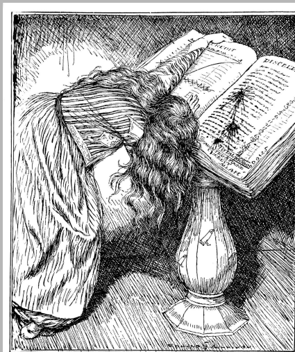
Illustration of Quatrain 51 by EJ Sullivan, 1913

The Rubaiyat of Omar Khayyam, Quatrain 51 tr. Robert Fitzgerald, 1859