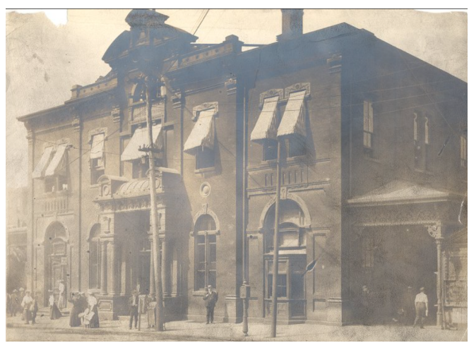
Federal Street Station c 1905