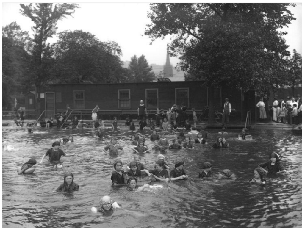
Lake Elizabeth Bathers, August 8th 1913