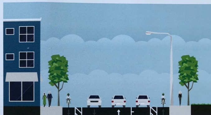
Brighton Road Proposed Conditions - Looking North